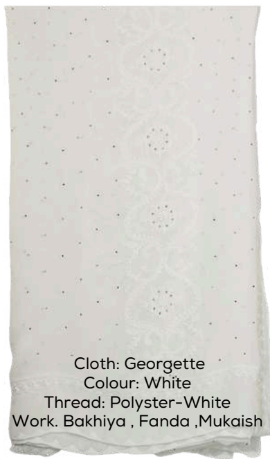
Cloth: Georgette Colour: White Thread: Polyester-White Work: Bakhiya, Fanda, Mukaish