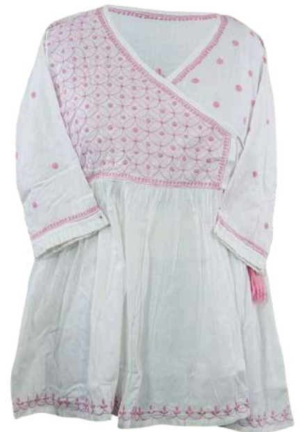
Cloth: Cambric cotton Colour: White Thread: Pink Work: Bakhiya, Ghaans Patti, Hol, Keel