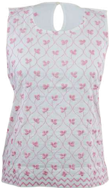
Cloth: Cambric Cotton Colour: White Thread: Pink Work: Dhoon Patti, Bakhiya Dori